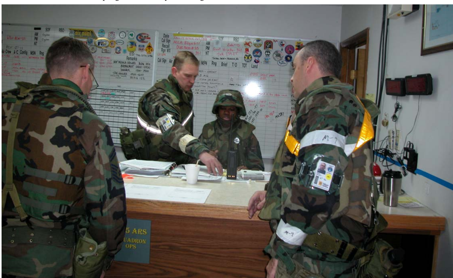
The 465th Air Refueling Squadron operations desk was a busy area to be around during the ORE.