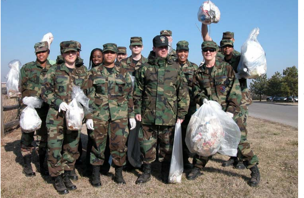
Several 507th ARW and 513th ACG members show off bags of loot they were able to find last month during the basewide cleanup efforts. APRIL 2007 "Readiness Is OUR Number One Priority"

During the cleanup, volunteers managed to net 67 bags of